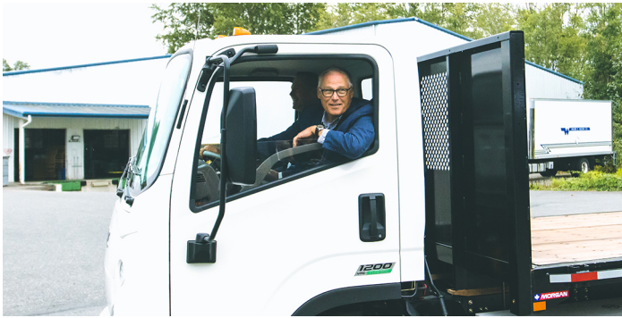
Gov. Jay Inslee takes a spin in Vicinity Motor's VMC 1200 truck.

These Washington-sourced grapes are now being crafted into B.C. wines, set to hit shelves from April 2025 to March 2028. This cross-border partnership underscores the resilience of the Canada-Washington trade relationship, ensuring that B.C.'s renowned wine industry continues to thrive.