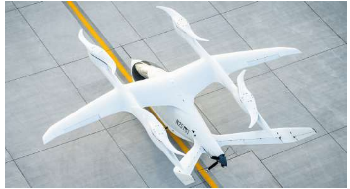
The ALIA-250 can take-off and land vertically.

In September 2021, Canada’s iSun Energy announced the acquisition of Vermont’s SunCommon to create a regional full-service solar installation leader servicing the residential, commercial, industrial and utility-scale markets including solar electric vehicle charging. The acquisition resulted in over 200 new Vermont-based employees at iSun. The 9-year-old company chose Vermont because the state promotes renewable energy and is friendly to electric vehicle policies. It is on a mission to create clean energy and mobility through the delivery of smart, connected, resilient and attractive solar power shading structures. iSun is an excellent example of the cross-border supply chain, as the company’s canopies are assembled in Canada using U.S.-made solar panels.