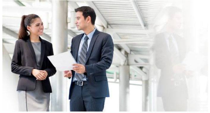
The ALIA-250 can take-off and land vertically.

Beta Technologies is a Burlington-based aircraft manufacturer with over 200 employees. Beta develops fully electric vertical takeoff and landing aircraft, as well as a charging network for the aircraft. Beta has partnered with Unither Bioelectronics , a subsidiary of United Therapeutics based in Québec, on the development of its autonomous airborne organ delivery system. United Therapeutics will act as an early adopter of Beta's Alia aircraft. Simultaneously, Beta has partnered with Montréal-based CAE , a world leader in simulation and training technologies for aerospace, to deliver a best-in-class training program for the Alia Aircraft.