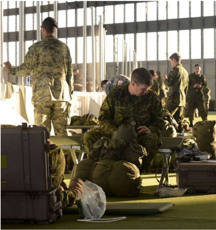
Members of the 41 Canadian Brigade Group prepare their gear in the Pride Hangar at Ellsworth Air Force Base, SD.