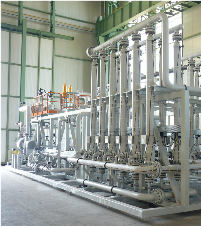
Membrane system for hydrogen recovery.