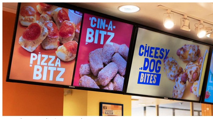
Wetzel's Pretzels signage.