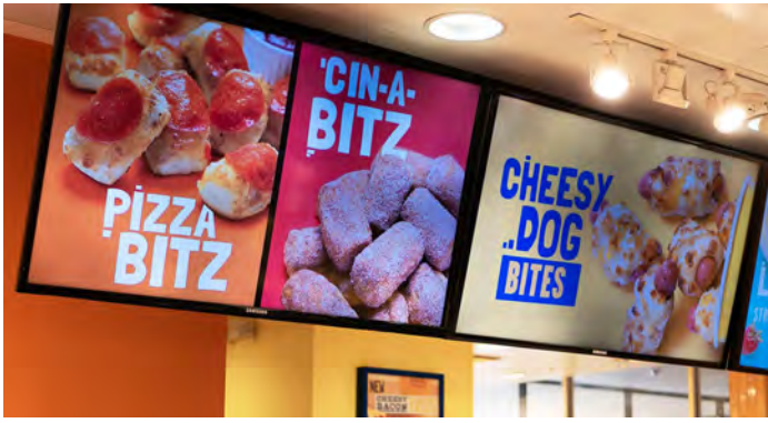
Wetzel's Pretzels signage.