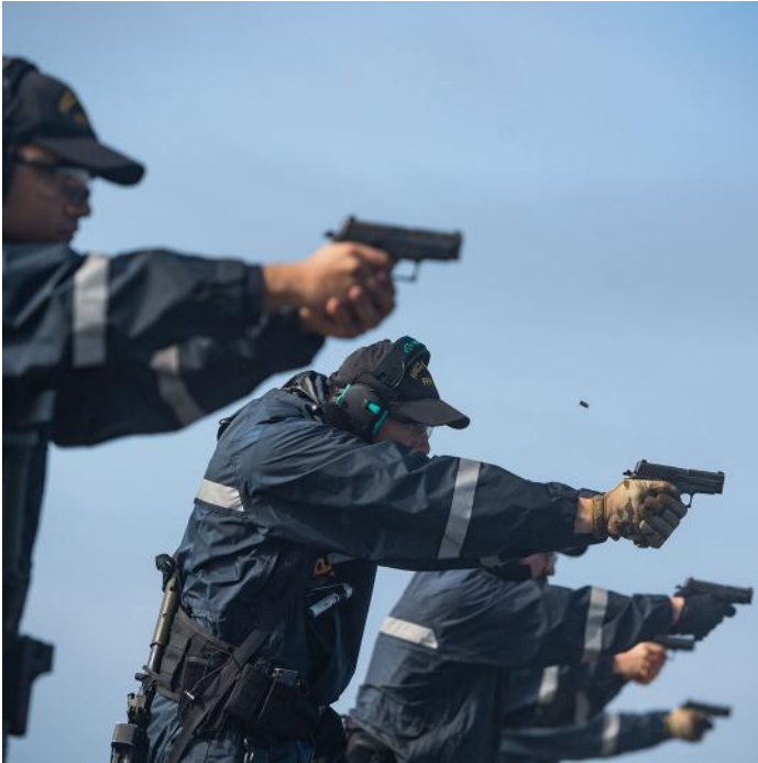
Members of the Naval Boarding Party fire SIG Sauer P320, as they practice their force protection drills.