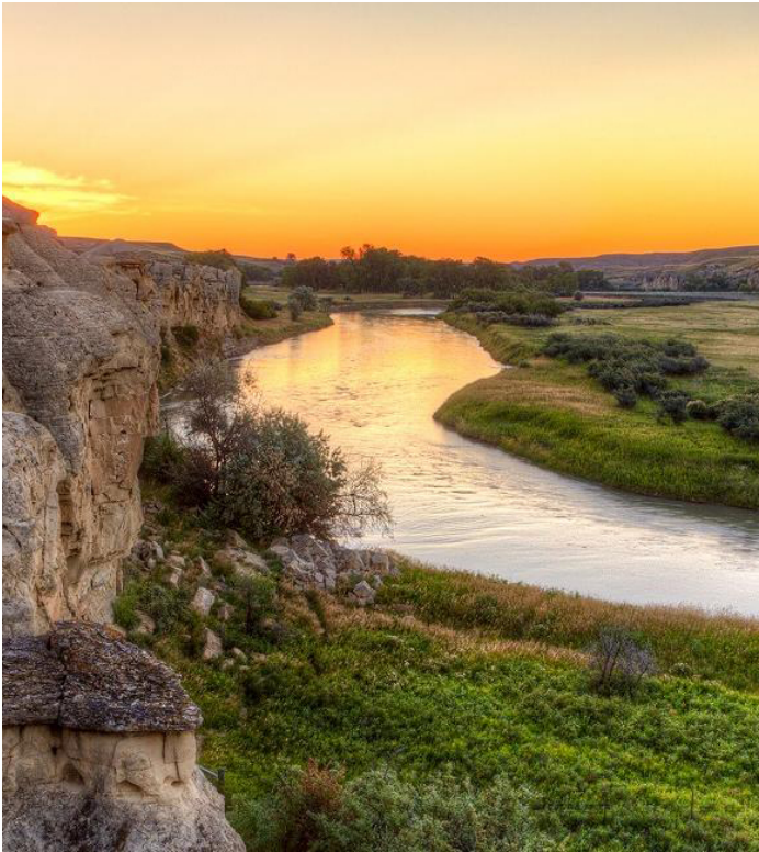
St. Mary & Milk Rivers