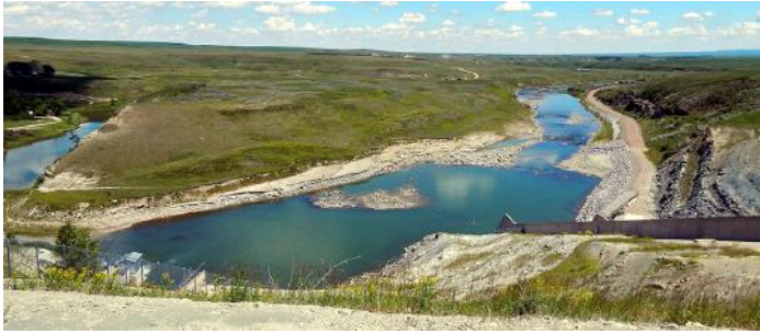
St. Mary & Milk Rivers