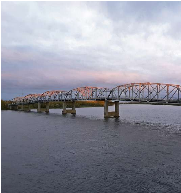
Baudette–Rainy River International Bridge.