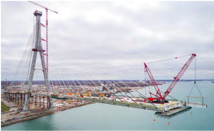
Gordie Howe International Bridge construction