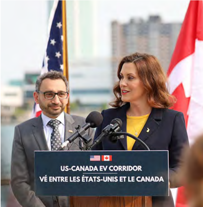
Canadian Minister of Transport Omar Alghabra and Michigan Governor Gretchen Whitmer at the US-Canada EV Corridor announcement