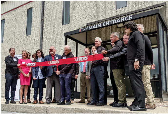
Ribbon cutting ceremony for the new IKO facility in Hagerstown.