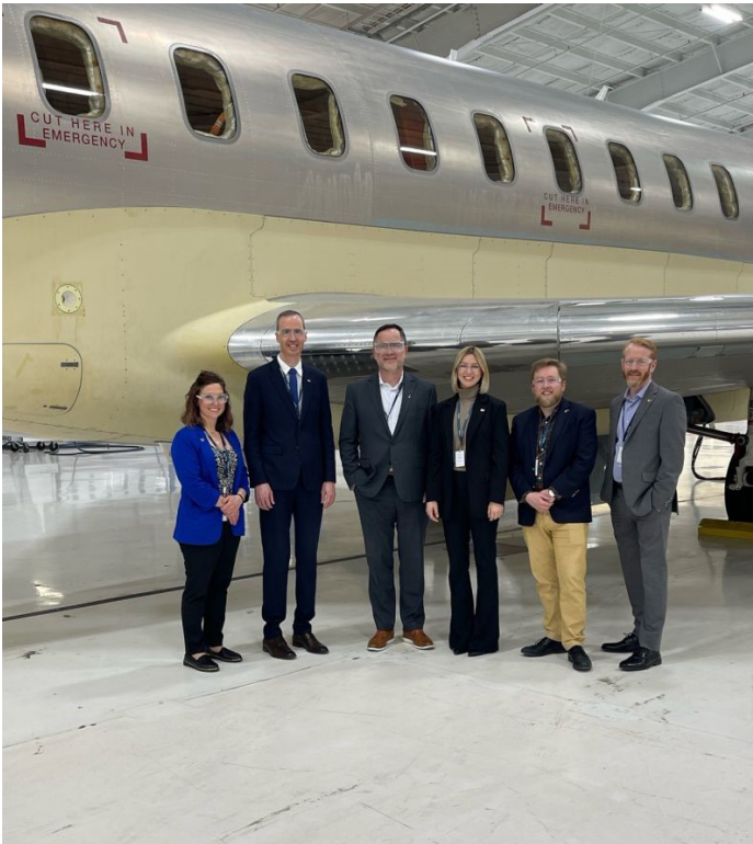
Bombardier Defense Challenger 650.