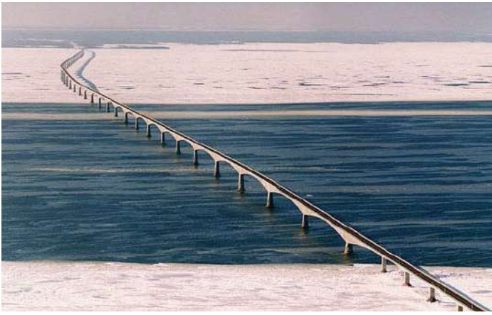
Confederation Bridge, the longest bridge spanning ice-covered waters