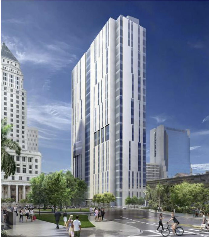
Miami Dade County Civil and Probate Courthouse.