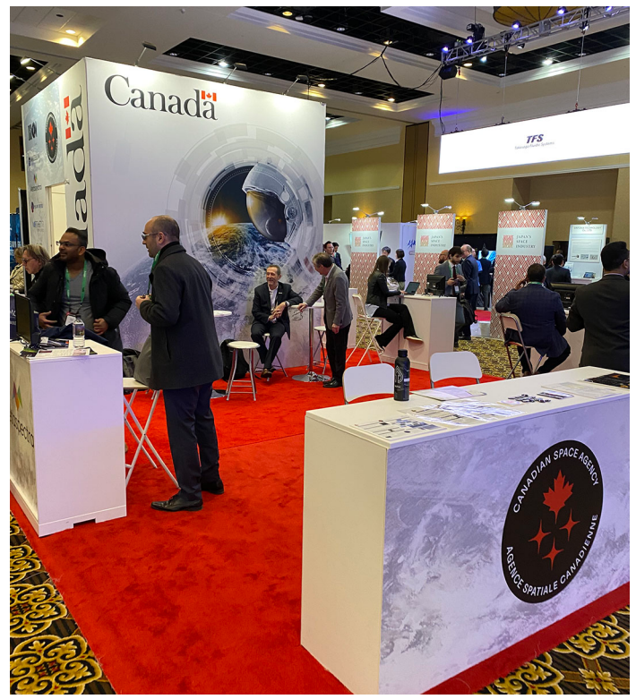
Canada's booth at the Space Symposium